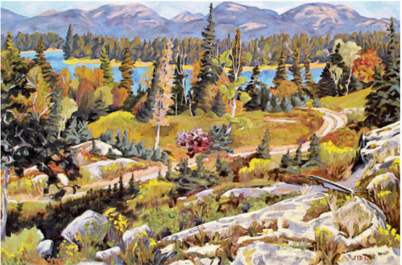
Robert Pollien, "Eagle Lake," 1992, oil on canvas, 12 x 13 inches from residency at Acadia National Park, 1992