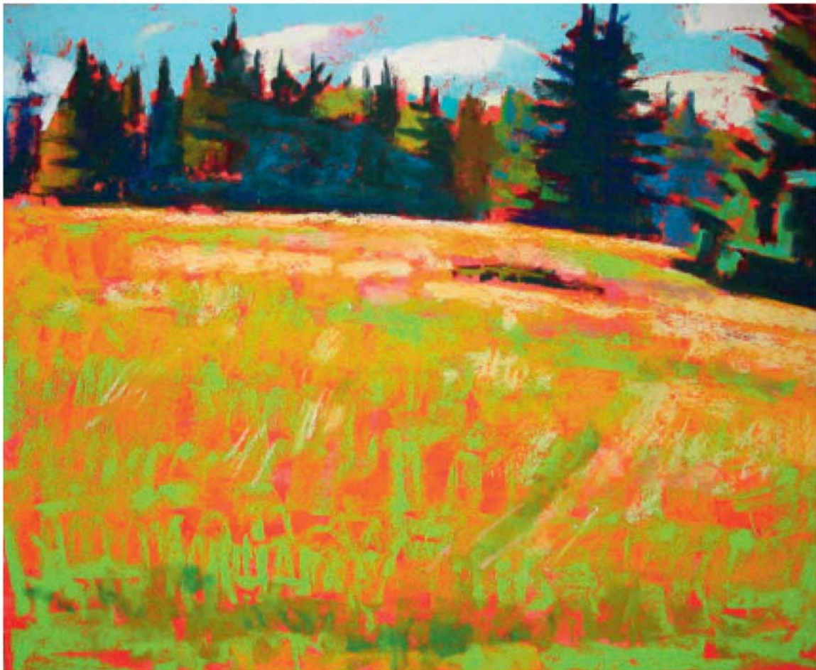
Tom Curry, "South Meadow, Great Spruce Head Island," pastel from Great Spruce Head Island residency